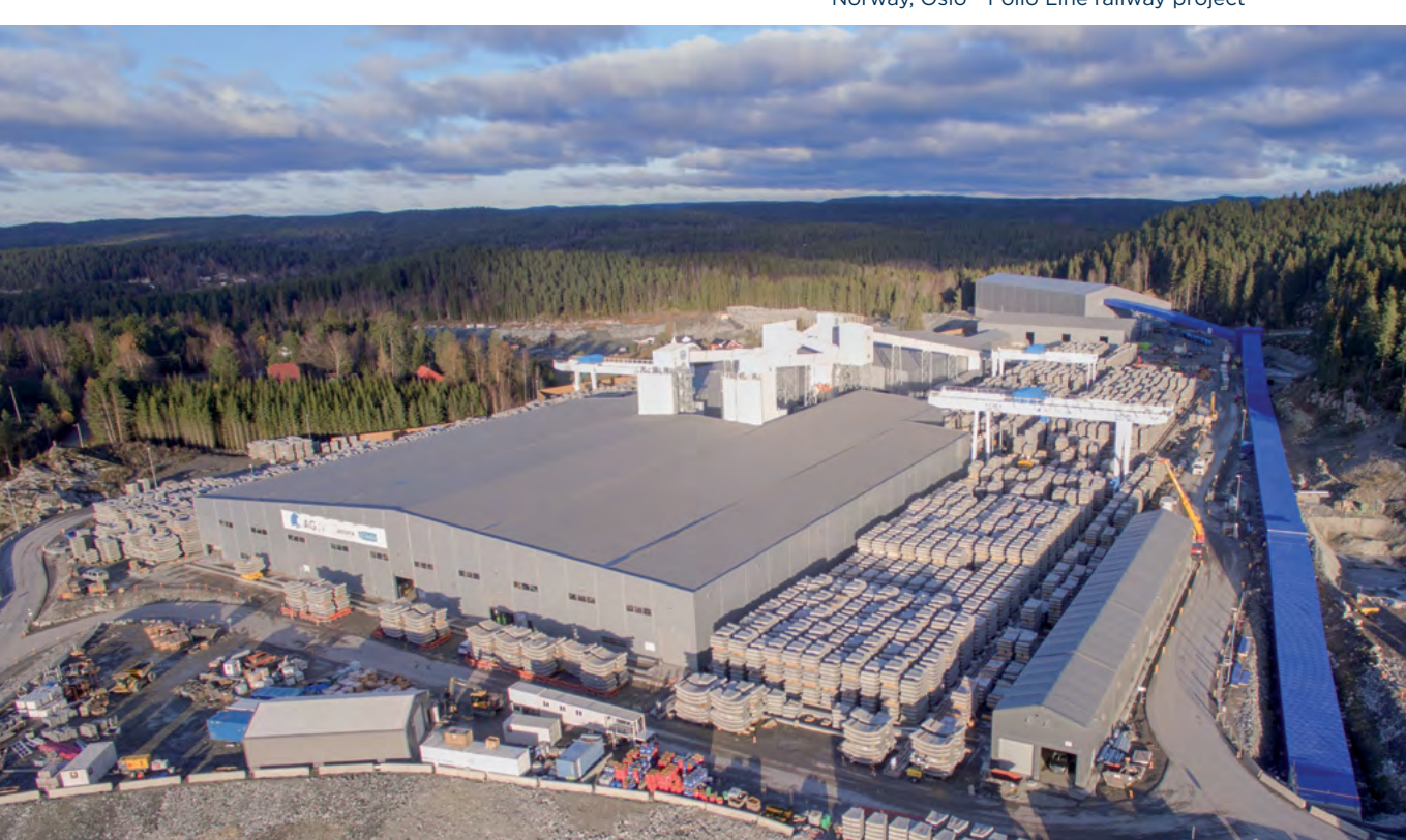
Norway, Oslo - Follo Line railway project

Ghella will endeavour to ensure that the guiding principles of its activity are appreciated and shared by all the persons that cooperate with it to achieve its objectives, and for that purpose it undertakes to promote them, in the context of its business activity, scheduling also appropriate training and information sessions for employees and consultants.