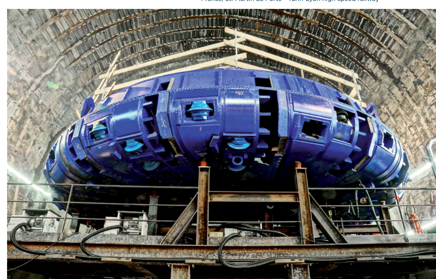
France, St. Martin La Porte - Turin-Lyon high speed railway

All the recipients shall promptly inform their direct Superior - who will inform the administrative Body and the Supervisory Body - of any summons to witness and of any criminal proceedings involving them, in any respect, in connection with their professional activity or anywise related to it.