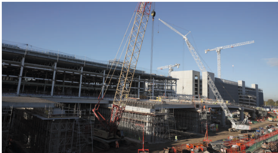
NEW TERMINAL WORK TAKES OFF Northwest England hub is meant to improve passenger experiences.

M anchester Airport in northwest England has begun the second phase of its $1.6-billion program with construction of a new 12-gate pier for Terminal 2 by London-based lead contractor Mace Group Ltd. Set for completion in 2025, the new pier will accommodate a variety of aircraft types. Other elements include a second security hall, expanded departure lounge and airfield reconfigurations. Mace will apply a variety of construction techniques to reduce embodied carbon emissions by up to 40%, such as precast concrete, prefabricated building components and an innovative piling design that minimizes excavation, according to the airport. New facilities will include nearly 30 shops, bars and restaurants. ■